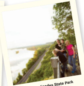
Mississippi Palisades State Park

Many attractions have reopened with limited capacity or different operating hours. Inquire with attractions ahead of time for up-to-date travel policies and health and safety information.