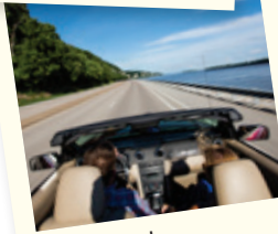
Great River Road