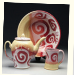
Mississippi Mud Pottery