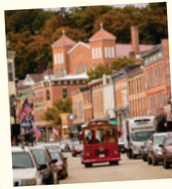
Main Street Galena