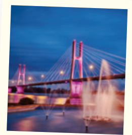
Quincy Bayview Bridge