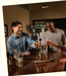
Blaum Bros. Distilling Company